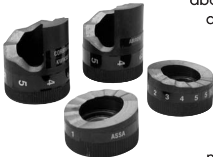
Optional Cams for the KX-1

When switching from one manufacturer to another, simply remove an allen screw to take the cam off of the machine. Reinstall the screw to put the new cam on the machine. Of course, depending on which type of key you plan on cutting, a cutting wheel change may also be necessary. Patented keys such as Medeco KeyMark™ may also need a vise change to properly hold the key.